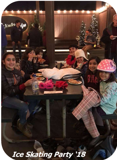
Ice Skating Party '18