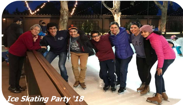
Ice Skating Party '18