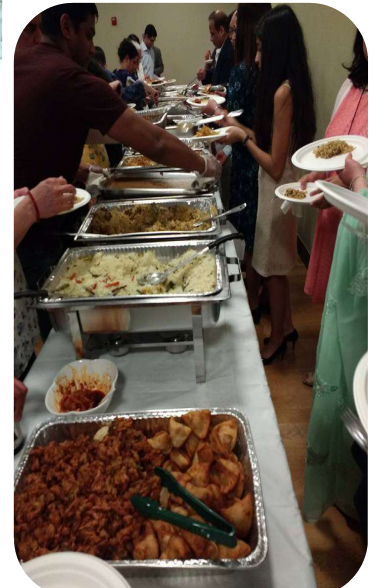
Navroze Dinner Mar '18