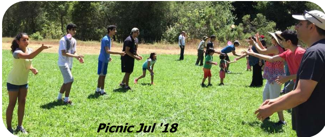
Picnic Jul '18