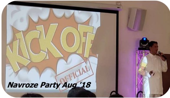
Navroze Party Aug '18