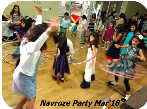
Navroze Party Mar '18