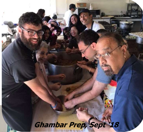
Ghambar Prep, Sept '18