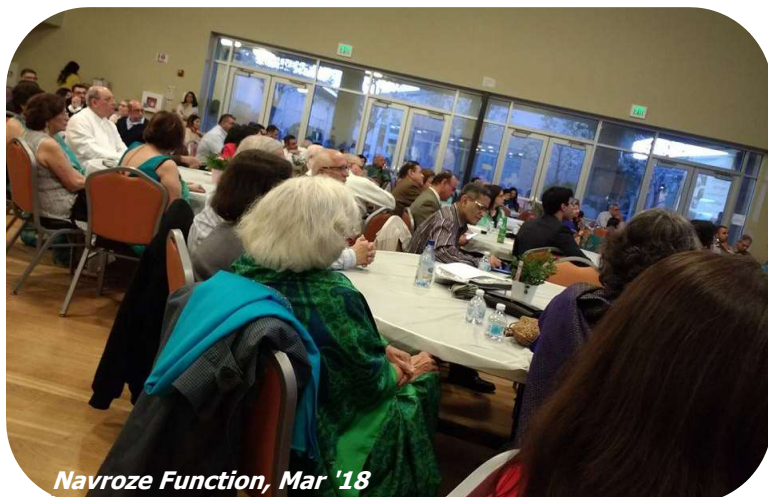
Navroze Function, Mar '18