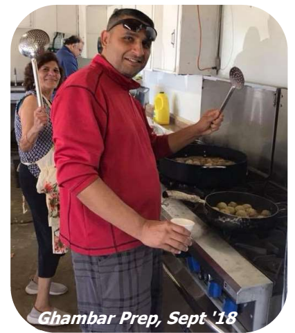
Ghambar Prep, Sept '18