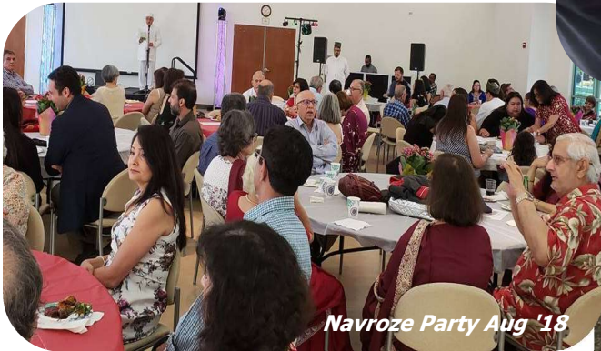
Navroze Party Aug '18