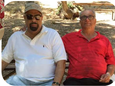
The chefs (Thank you!), Picnic, Jul '18