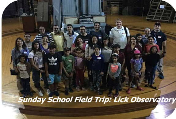
Sunday School Field Trip: Lick Observatory