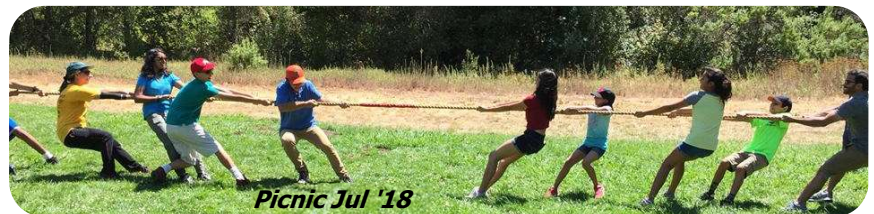
Picnic Jul '18