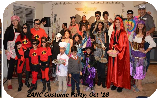
ZANC Costume Party, Oct '18