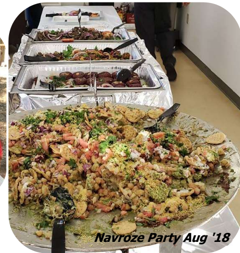
Navroze Party Aug '18