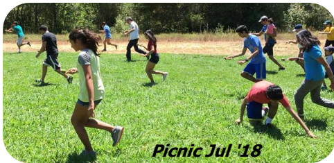
Picnic Jul '18