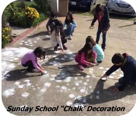
Sunday School "Chalk" Decoration