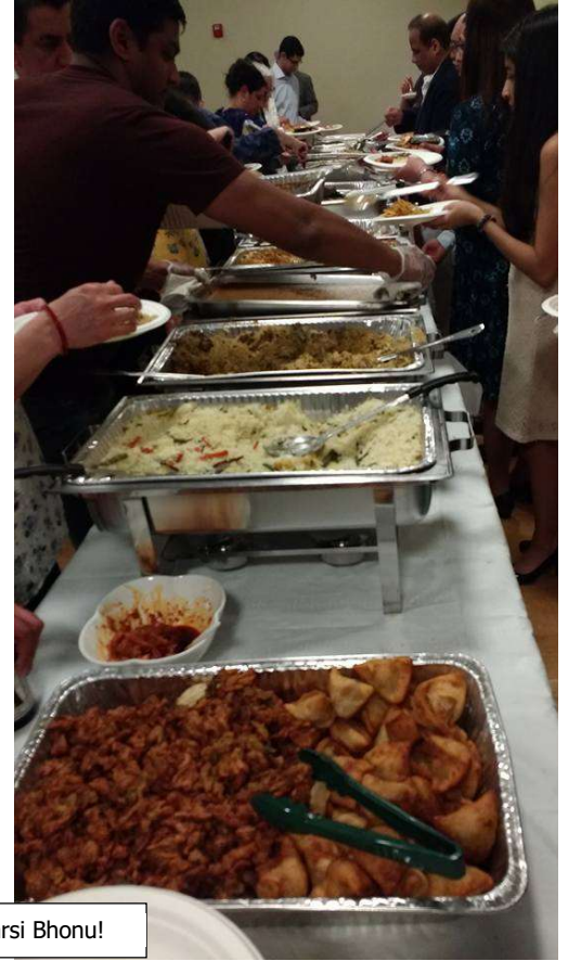
Lip-smacking Parsi Bhonu!