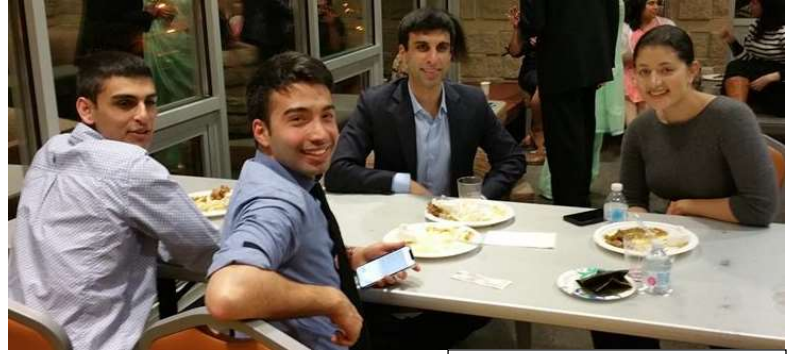
The future of our Community!