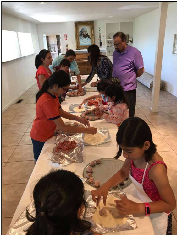
Sunday School - Cooking class!