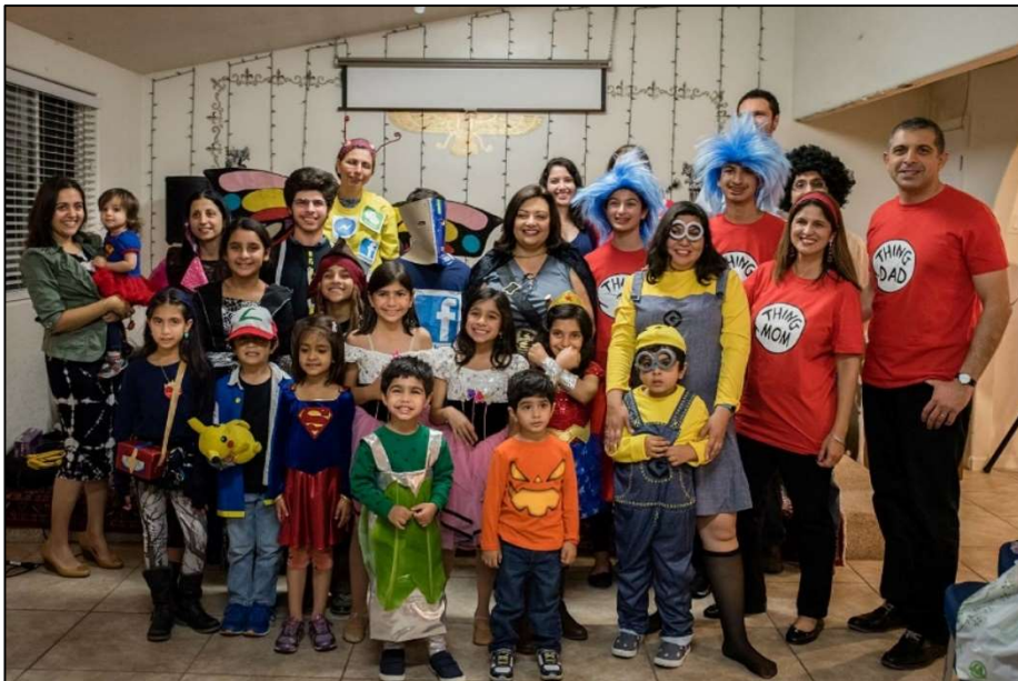
Costume Party and Bingo