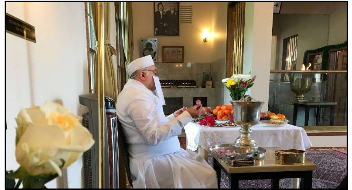
Mar Navroze Jashan