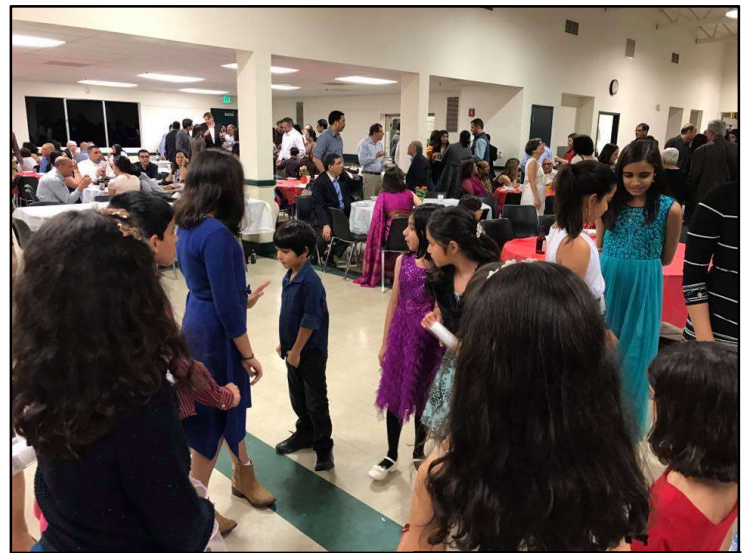
Mar Navroze Dinner Party