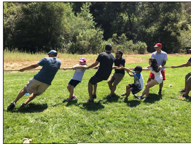
Tug-o-war at Summer Picnic 2017