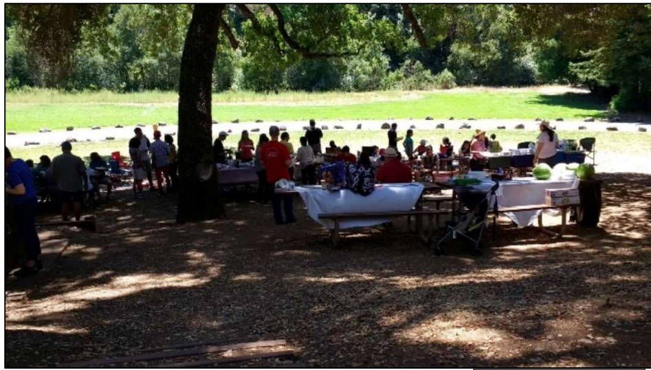
Summer Picnic 2017