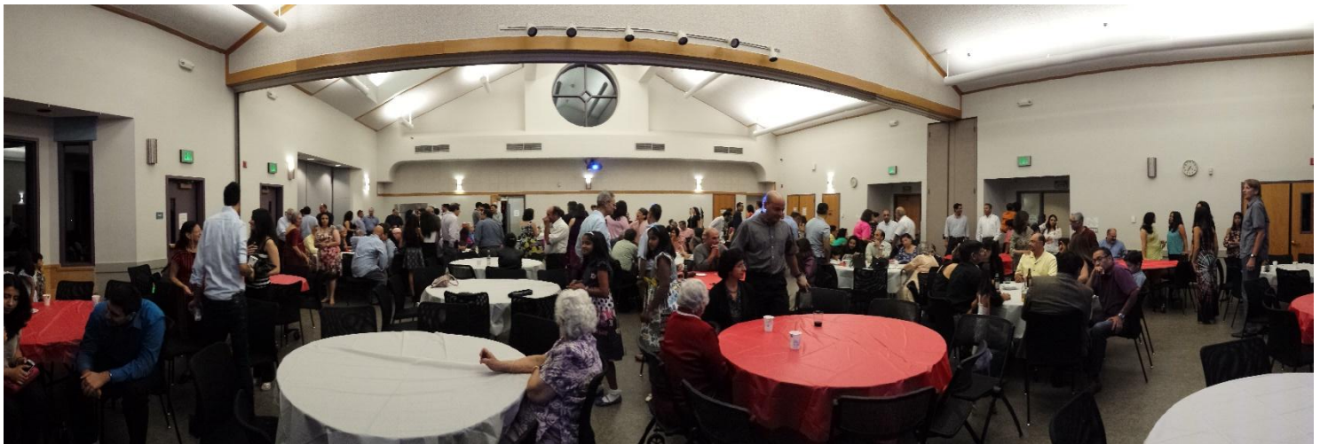
ZANC Members enjoying the Ghambhar at the Berryessa Community Center, Sept 2016