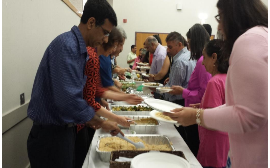
Yummy Dinner cooked by the community volunteers