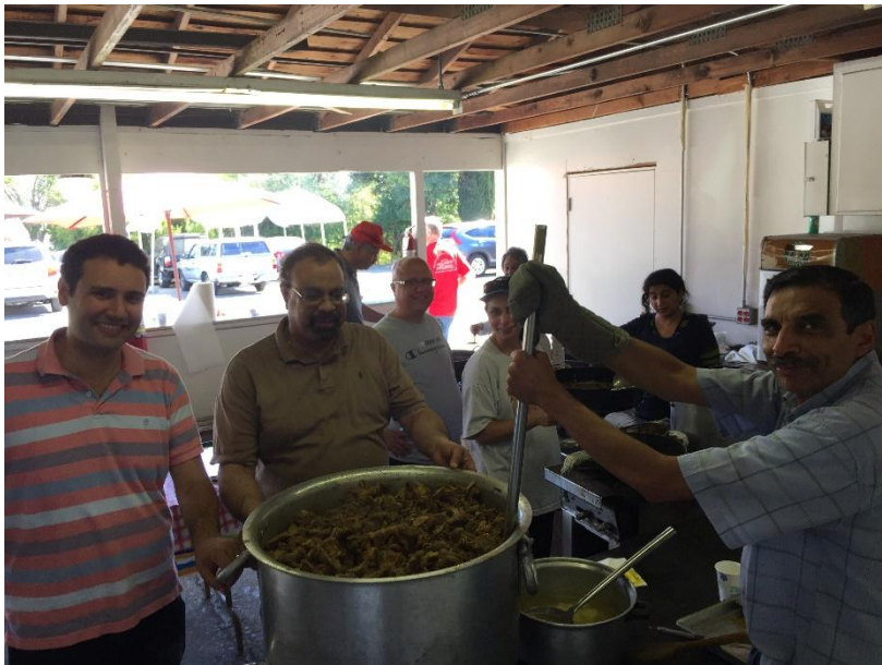
Community chefs in action!

The evening concluded with a spot of dancing to some groovy tunes!