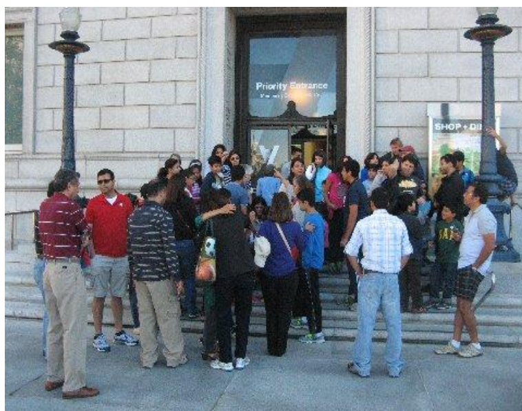
THE ZANC group at the AAM