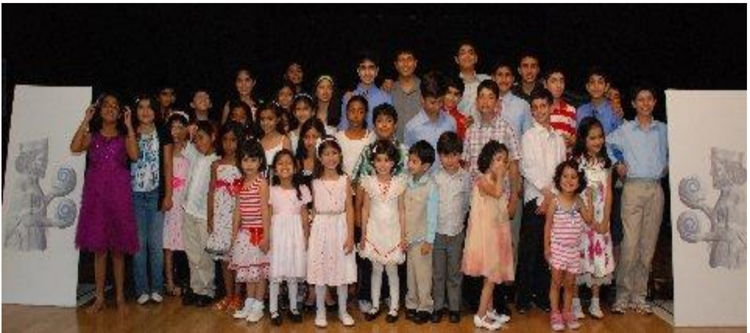
ZANC's Future! (Aug 2013)

Want to see it in color?? Check out the ZANC newsletter in color at www.zanc.org