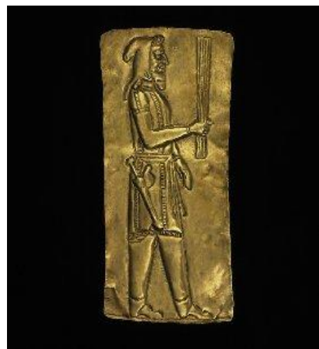
A Priest carrying Barsom