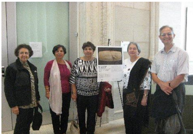
ZANC members at the panel discussion