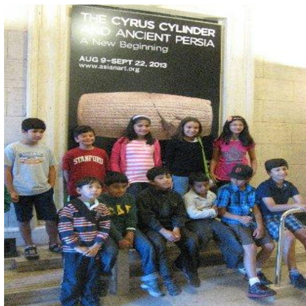
ZANC kids at the AAM