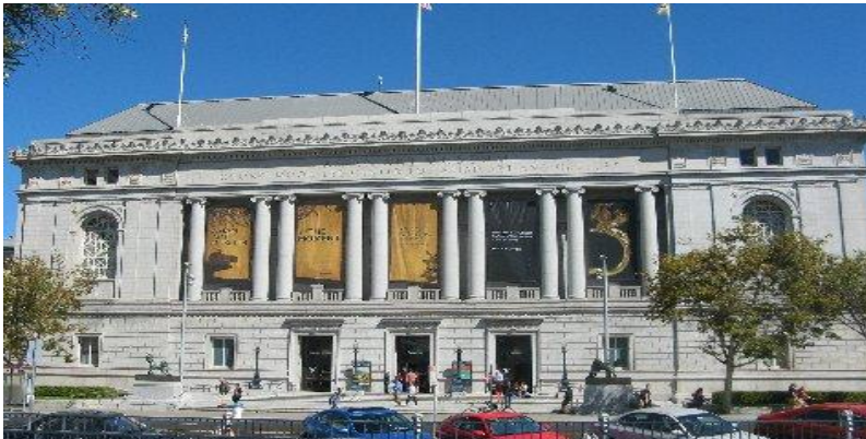
Asian Art Museum at San Francisco