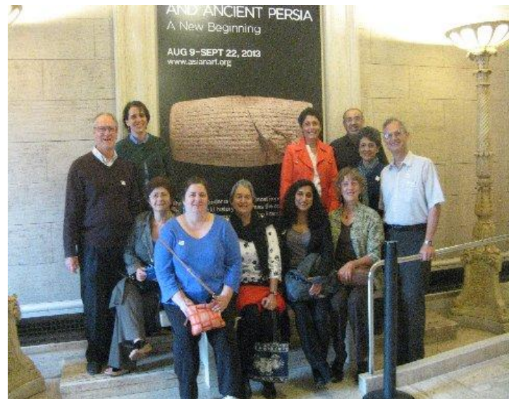
ZANC & PZO members at AAM