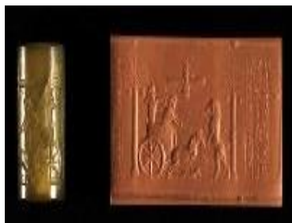
Darius Cylinder Seal (note the Farohar)